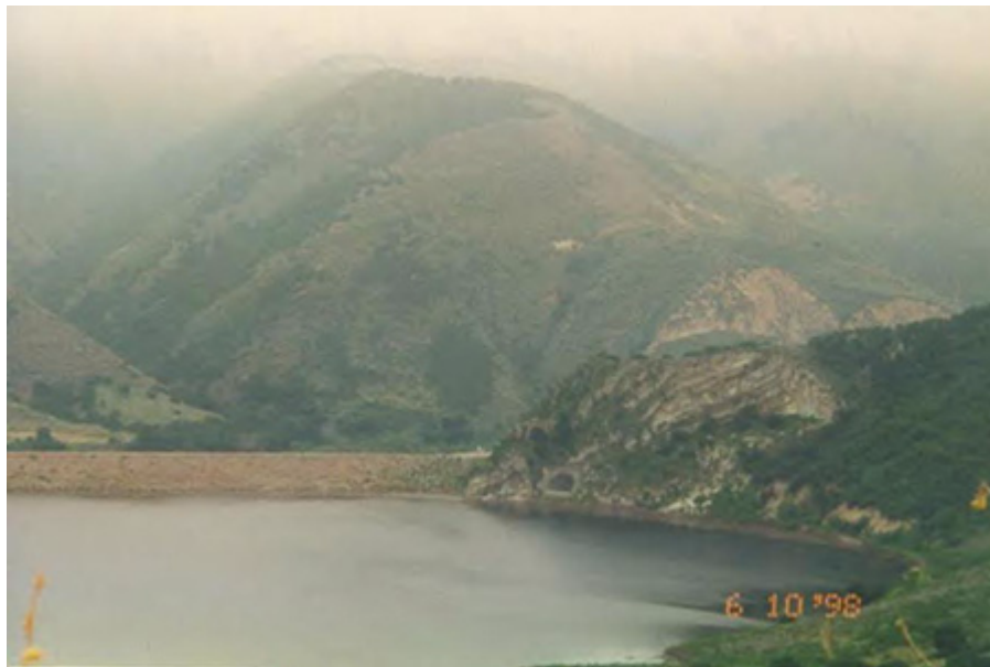
Twitchell Dam and Reservoir following a big El Nino year.

Under the Current Water Control Manual (WCM), approved in 1960, downstream water releases from Twitchell Dam into the Cuyama River are not required until the reservoir water surface elevation has risen from 474 to 623 feet. When the 623-foot elevation mark has been reached, the lesser of either 500 c.f.s. or the reservoir inflow must be released downstream. See the United States Army Corps of Engineers website http://www.spl.usace.army.mil/resreg/htdocs/twitchell.html for additional information about the physical characteristics and entire schedule of controlled and uncontrolled water releases for Twitchell Dam.