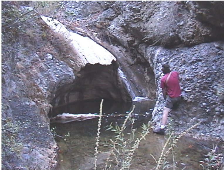
Waterfall at Turtle Bowl Creek