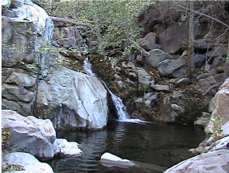
10' tall bedrock waterfall