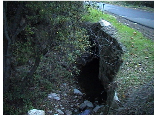
SC_TT_24 (Looking downstream) 12/16/02