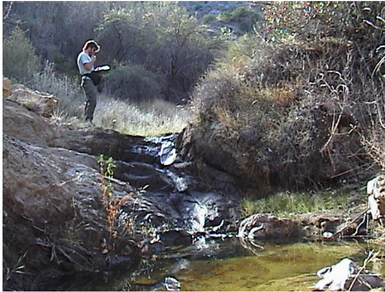
Bedrock chute looking upstream

Barrier ID: SC_BB_SF_1 Stream: South Fork Big Bend Creek Barrier Type: Bedrock Chute Physical Location: Approximate elevation 2294' GPS Location: N 34° 47' 35" W 119° 50' 51.2" Ownership/Interest: Los Padres National Forest Surveyor(s) and Date: Matt and Jim Stoecker 12/09/02