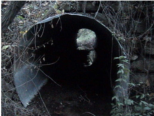
SC_TT_24 (Looking upstream); 12/16/02