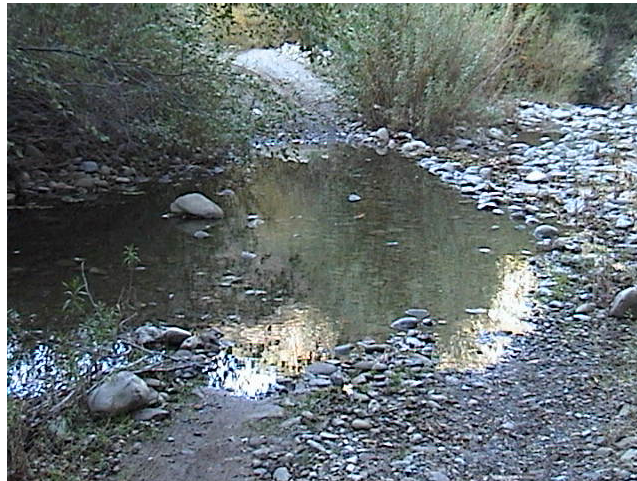
Typical In-stream Road Crossing on Manzana Creek