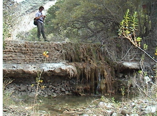
Sacrete berm on top of concrete footing

Description: This obsolete dam consists of a concrete footing that has a sacrete berm built on top. The dam height measured 10 feet 6 inches from the top of the dam to the surface of the downstream pool, which had a maximum depth of 18 inches. The dam's small, upstream reservoir is completely filled in with sediment. Kevin Cooper, Wildlife Biologist with the LPNF, thought the dam might be an old Santa Barbara County debris dam that was built after a local fire to catch sediment and/or act as a possible gaging station. The dam is not thought to serve any current purpose and does not appear to have been used to divert water.