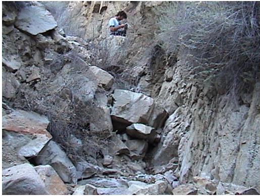
Upstream view of boulder/bedrock barrier

Surveyor(s) and Date: Matt and Jim Stoecker 12/09/02