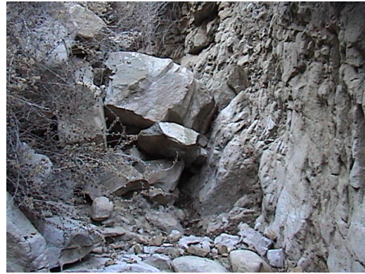
Upstream view of boulder/bedrock barrier

Description: This steep bedrock and boulder stream reach occurs in a confined canyon. Large boulders and exposed bedrock produce a nearly vertical drop with a height of 9 feet to the downstream substrate. Immediately downstream a large landslide would also likely prevent upstream migration, but this feature may flush out with high stream flows.