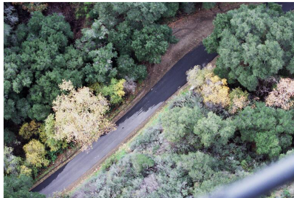
SC_TT_24 (Aerial View) 12/30/02

Description: This county road crossing on Tepusquet Road consists of one 6-foot diameter corrugated metal culvert that conveys stream flows underneath. The overall length of the culvert is approximately 60 feet. The inlet and outlet of the culvert are set at streambed level and an average of 12 inches of substrate was deposited along the bottom of this large culvert.